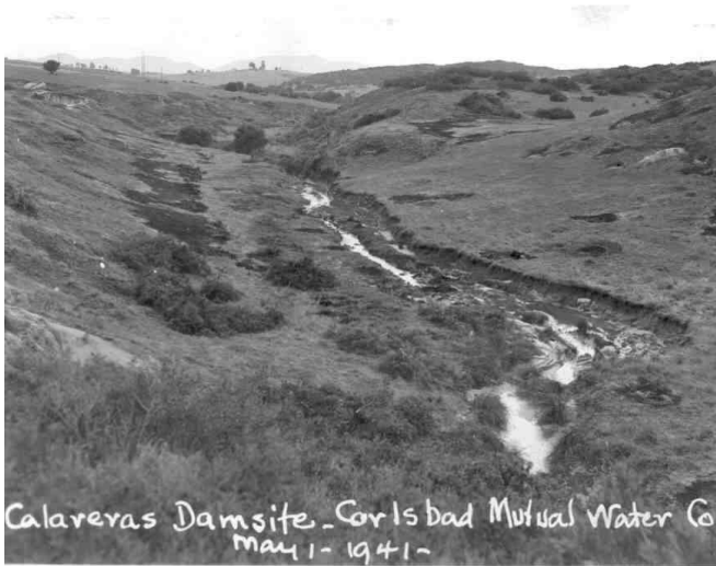
Calaveras Dam site - Carlsbad Mutual Water Co May 1 - 1941 -

The 1890s proved to be a difficult one for residents. A prolonged drought caused many families to leave town. Carlsbad residents turned to water wells powered by the wind such as these located on Harding Street in 1898. The South Coast Land Company purchased much of the downtown land from departing residents. Between 1906 and 1914, this company laid redwood pipes from the San Luis Rey River to Carlsbad, providing a reliable source of water for residents. They formed a water company known as the Oceanside Mutual Water Company, later changed in 1927 to the Carlsbad Mutual Water Company. It was this water company that provided Carlsbad with water until the 1950s, when a combination of increased population and salinity forced the residents to look for an alternate source.