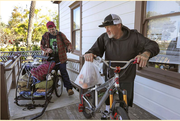
Shipley-Magee House back deck