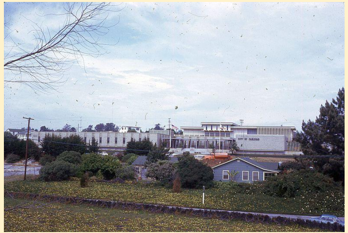
Circa 1960s The completion of I-5 meant a realignment of Pio Pico and construction of a new Carlsbad City Hall