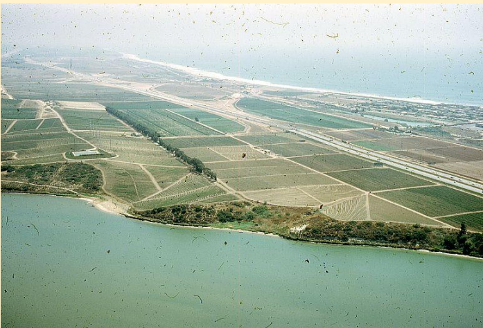
Circa 1970s Flower fields and Agua Hedionda Lagoon area- before Car Country Carlsbad