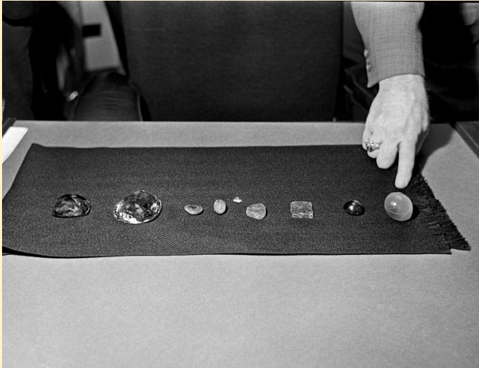
"Star of India" sapphire

Jack Murphy, "Murph the Surf" served two years jail time for the gem theft, and later returned to prison for several decades after being convicted for a brutal homicide in Miami.