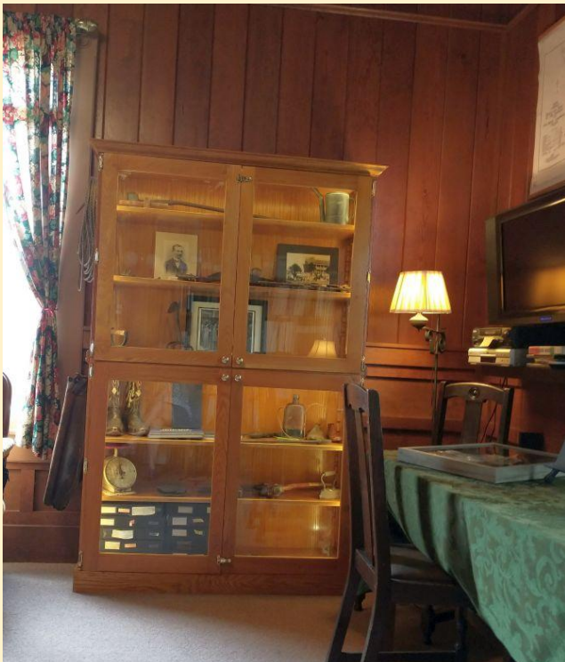
New Display for Allan Kelly's collection