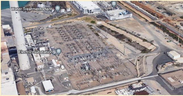
Encina Power Station switching yard

remodel construction on the 50-plus-year-old school. (Unfortunately this new tree has died too.)