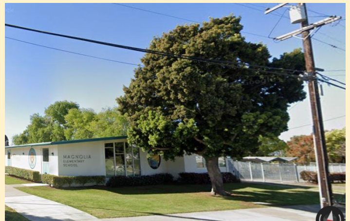
Original magnolia tree in front of Magnolia Elementary