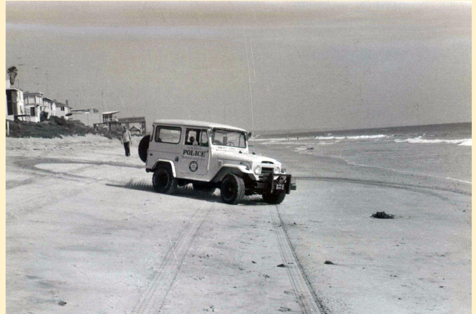
One of first vehicles patrolling our beaches