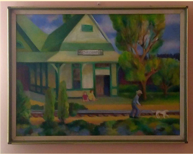
Carlsbad train station by Hilda Mohler