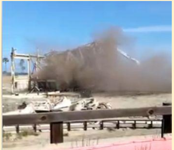
Final explosion of the remaining structures of the power plant