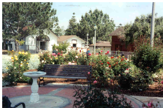
California Costal Rose Society

Thanks to the volunteers that keep the garden in front of the Shipley-Magee house looking beautiful, and to the California Costal Rose society that has taken over all of the rose plants.