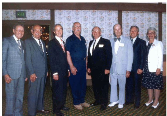
Former and current mayor of Carlsbad