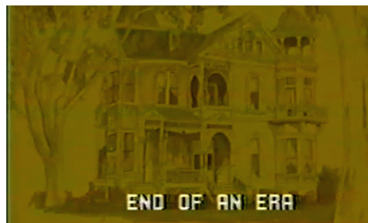
End of an Era

Added more Videos: Our web page now has five historical videos that are linked to our YouTube account.