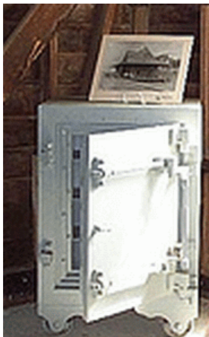
Late 1800's safe from the Feed Store

We are working on a story of the safe and have been able to track down the manufacturer's name and the patents of the timing lock mechanism.