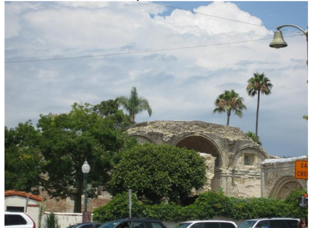
San Juan Capistrano Mission