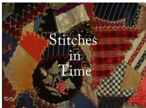
Stitches in Time