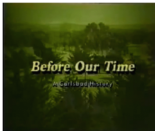
Before Our Time