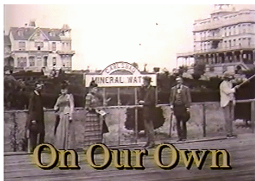
On Our Own