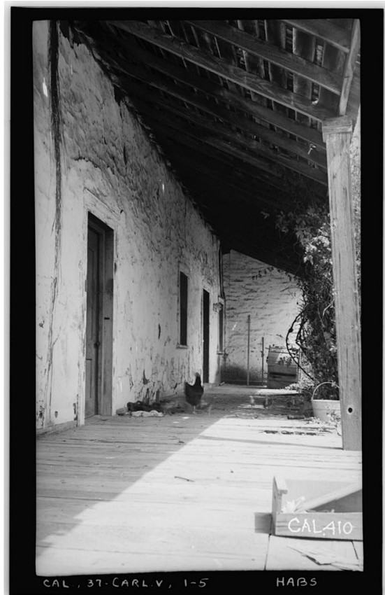
The Rancho Agua Hedionda Adobe