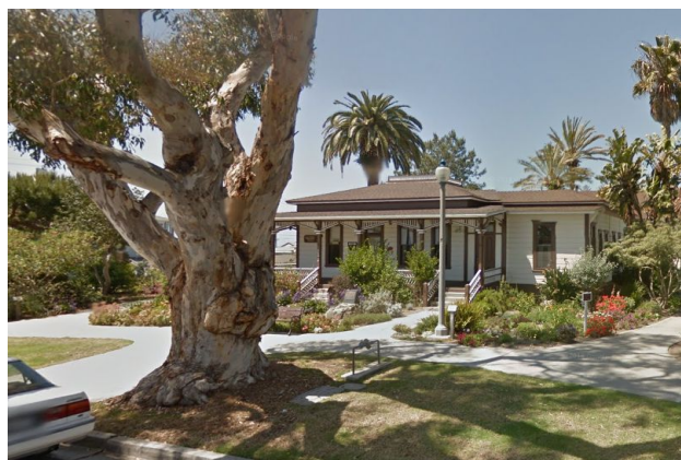
One of two Shipley-Magee House Eucalyptus