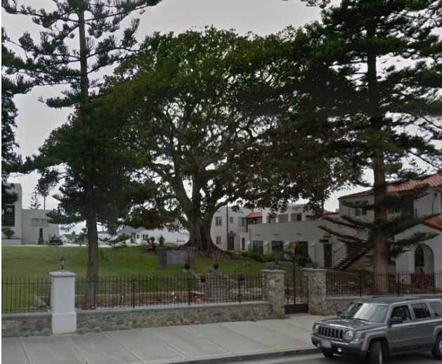
Morton Bay Fig at Army-Navy Academy

Another historical tree is located in the yard of the Army-Navy Academy. This is a Morton Bay Fig and it dates from the 1920's when the property was originally developed into the Red Apple Inn.