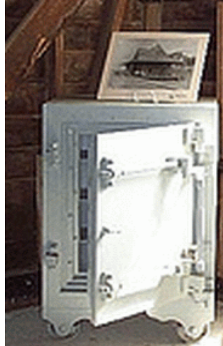
First Carlsbad Safe