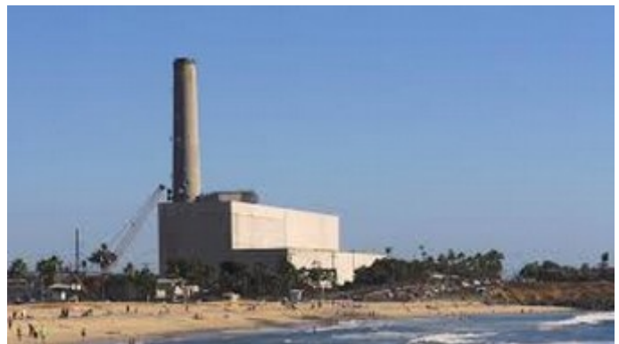
Carlsbad's Power Plant is 62 years old

The power plant has played a significant part in our city's history as it was fundamental in gaining the necessary tax funds for us to establish our own city. Taxes from the power plant gave the City of Carlsbad operating funds in the 1950s. Many who grew up in Carlsbad and associate the power plant with "home" are promoting the idea of keeping the power plant smoke stack and painting an interpretive mural to document our history.