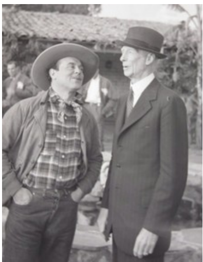
Leo Carrillo and Connie Mack