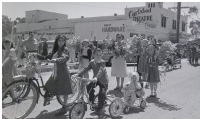
Carlsbad Flower Show parade 1950 State Street

Encinitas Historical sent us a few postcards of the Twin Inns and one of Alt Carlsbad. Carlsbad By The Sea Retirement Community donated Carlsbad Hotel fireplace tools, and they are now located in the barn.