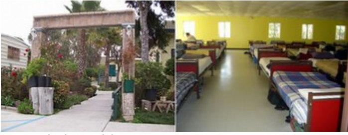
La Posada de Guadalupe

Another organization in North County with similar mission is the " Bread Of Life Rescue Mission ", in Oceanside. They have been operating since 1999.