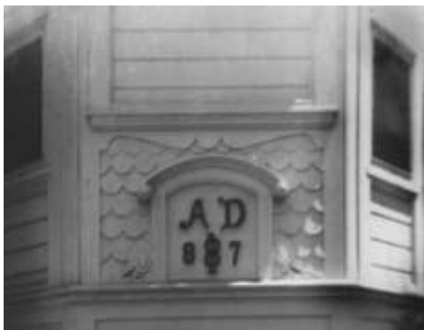
Note "1887" on the Wadsworth house