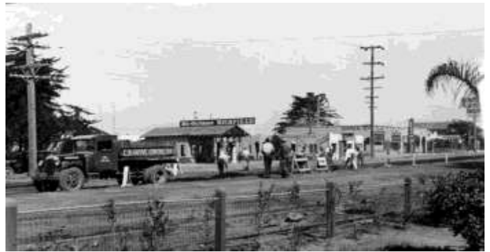
This is PCH 101