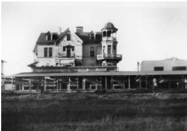
Wadsworth house before demolition