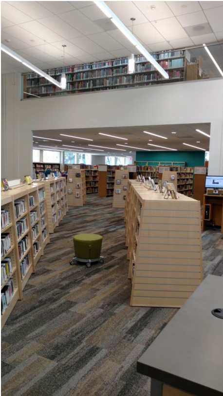
Georgina Cole Library Reopens

for our area. By 1956 she had convinced the city of the need for their own library system, one that reflected our own community needs. And by 1963 she had gathered support from city officials and residents for a permanent city library building. Formation of the Friends of the Carlsbad Library, helped lead the fight for the new library, promoting the bond issue that financed the construction of the library which passed with 75% approval.