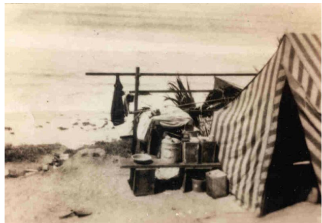
1920s Carlsbad bluffs by Carlsbad Hotel