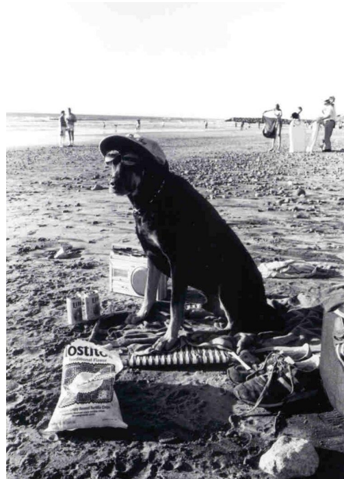
1980s – Dog days of summer