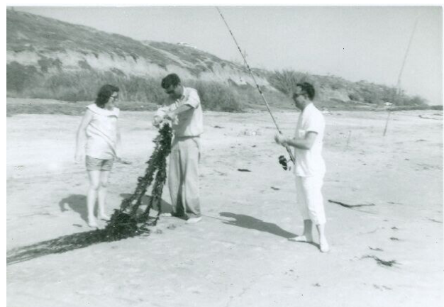
1950s- Fishing below Pine Street