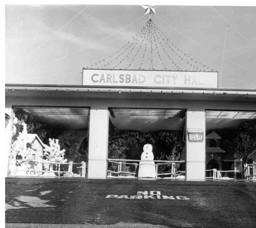
Carlsbad Fire Station on Pio Pico -1950-60