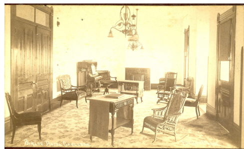
This is an interior shot of the Carlsbad Hotel.

The dining room is a marvel in its size and appointments off from the dining room is a large kitchen, pastry room and pantry. On the east side are ten fine large suits of rooms. A sixteen feet porch extends almost entirely around the building.