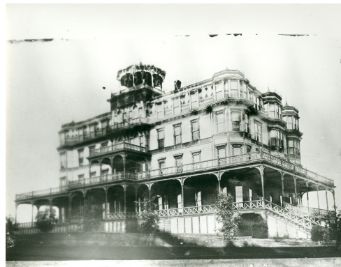
The Carlsbad Hotel, constructed in 1888, located on Grand and Highway 101, viewed looking northwest. This location would be directly across the street from present day St. Michael's Episcopal Church.