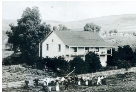
Los Quiotes 1905