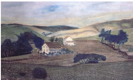
Oil painting of Los Quiotes

Father had rented the rooms at Old Town for a month, and at the end of that time he came back to town on horseback and hired a man with a big wagon and four horses to take the family and their belongings out to the ranch. I have often heard Mother tell of that experience. Of starting from Old town early in the morning and arriving at the ranch after it was dark. In the hurry of packing up that morning, all the matches they had with them had been placed in some place where they could not be found.