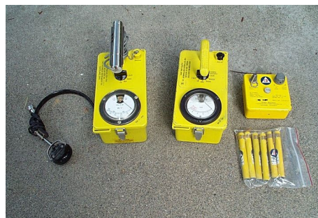
Geiger counters and radiation monitors

These donations have added to the megaphone and search lamp given to us previously, and now form a display section inside the Barn. The Geiger counters and monitors came from the Civil Defense organization. There is a lot of history on the efforts to fight a nuclear attack in San Diego.