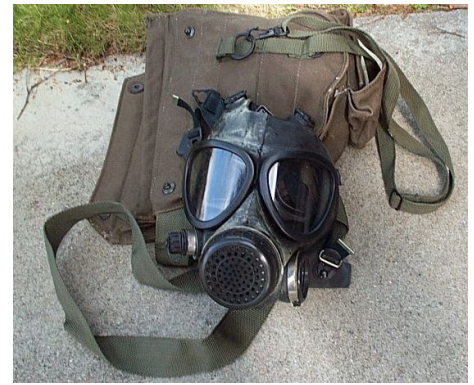
Tear gas mask and canister